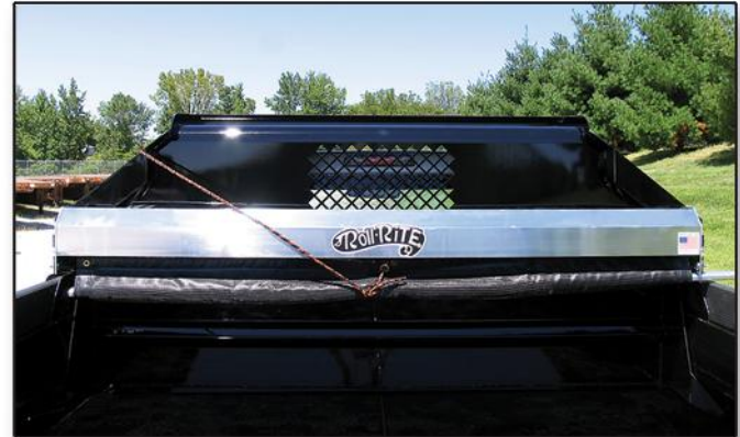
Tapered Cab Protector