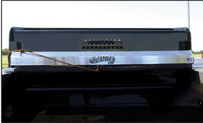
Straight Cab Protector