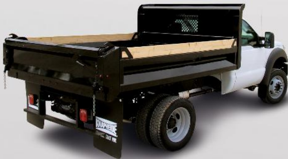
KDBDS912A w/ Straight Cab Protector