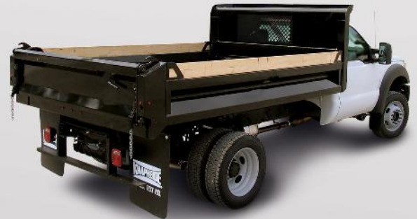
KDBDS1112A w/ Straight Cab Protector