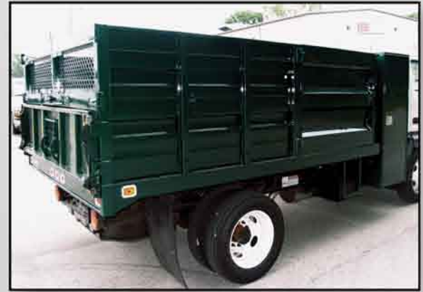
PLB-110B with KPLS-942463A