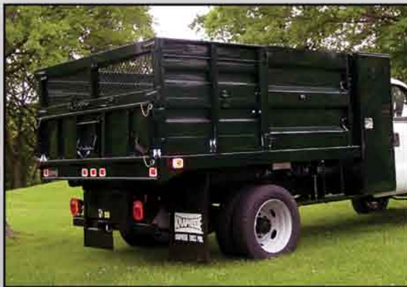
PLB-090B with KPLS-942463A