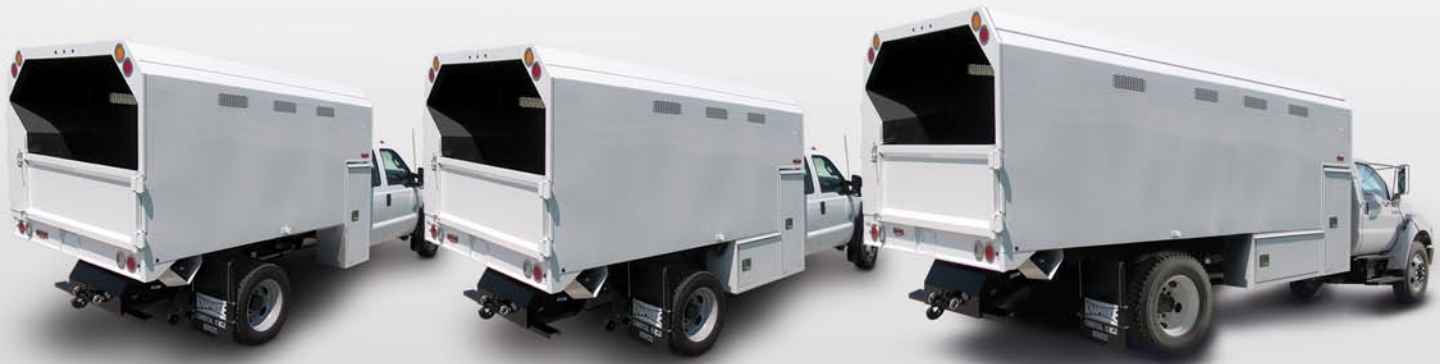
KFB13560NA with I-Pack KFPI24A-E