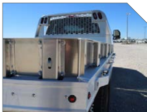
ALUMINUM SIDE BOARDS