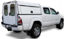
ALUMINUM COMMERCIAL UTILITY