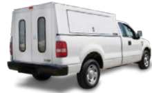
HEAVY DUTY STEEL