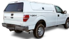
PRO SERIES MULTIPLE OPTIONS