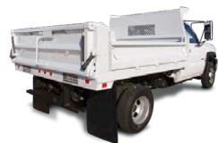
HEAVY DROP SIDE CONTRACTOR