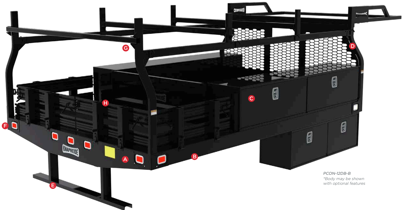
PCON-12DB-B *Body may be shown with optional features

Storage, access and function are the calling card of this multi-functional unit. Carry and store all you need with the Knapheide Contractor Body.