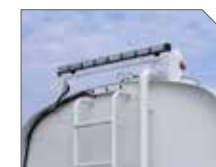
LIGHTING PACKAGES: WARNING & WORK LIGHTS