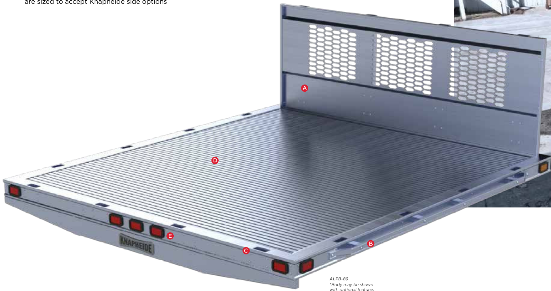
ALPB-89 *Body may be shown with optional features