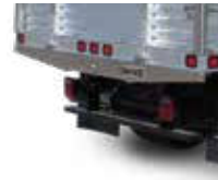
CLASS V RECEIVER HITCH available with 12K or 21K ratings