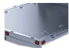
INTEGRATED D-RING TIE-DOWNS