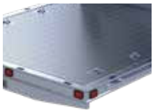
INTEGRATED D-RING TIE-DOWNS