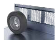
SPARE TIRE RETAINER