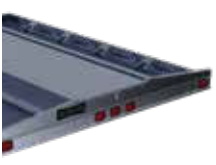
UNDERBODY STORAGE COMPARTMENT