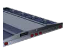
UNDERBODY STORAGE COMPARTMENT