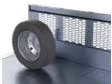
SPARE TIRE RETAINER