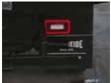
KNAPHEIDE LED TAIL LIGHTS