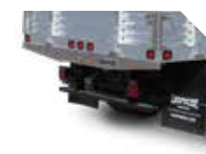
CLASS V RECEIVER HITCH available with 12K or 21K ratings