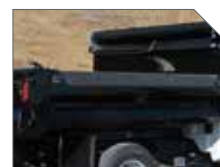
POLY BOARD EXTENSIONS