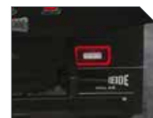
KNAPHEIDE LED TAIL LIGHTS