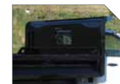
STRAIGHT FULL CAB PROTECTOR