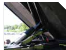
BODY RAISE INDICATOR