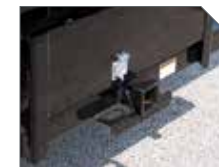
CLASS V RECEIVER HITCH