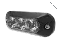
FRONT STROBE LIGHTS