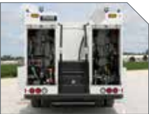
SPLIT REEL CABINETS