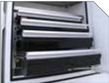
ALUMINUM MECHANIC DRAWERS