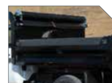
POLY BOARD EXTENSIONS