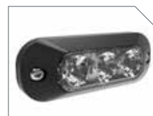
FRONT STROBE LIGHTS