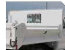
STRAIGHT QUARTER CAB PROTECTOR

'-P' denotes prime paint; '-B' denotes black finish paint. GM C/K 3500 chassis applications