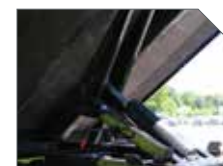
BODY RAISE INDICATOR