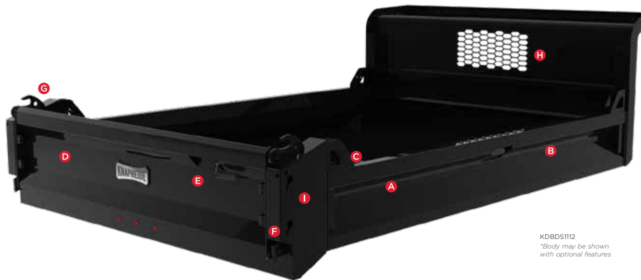
KDBDS1112 *Body may be shown with optional features

constructed of 10-gauge high tensile steel with a punched window for visibility