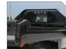
TAPERED QUARTER CAB PROTECTOR