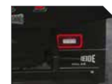
KNAPHEIDE LED TAIL LIGHTS