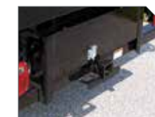
CLASS V RECEIVER HITCH