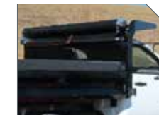
STRAIGHT FULL CAB PROTECTOR