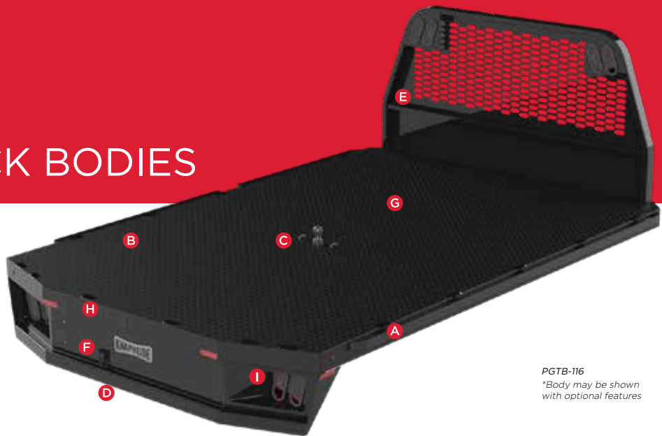
PGTB-116 *Body may be shown with optional features