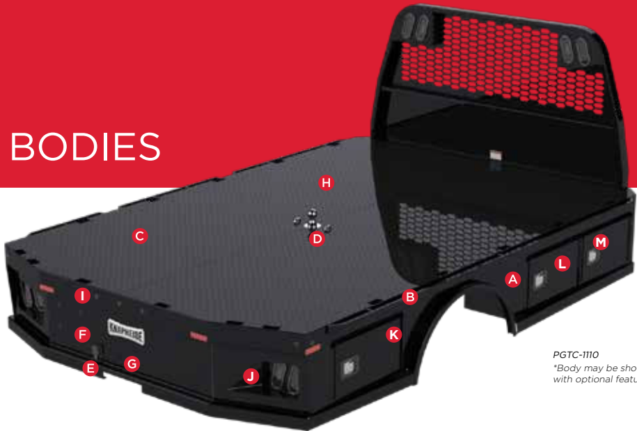
PGTC-1110 *Body may be shown with optional features