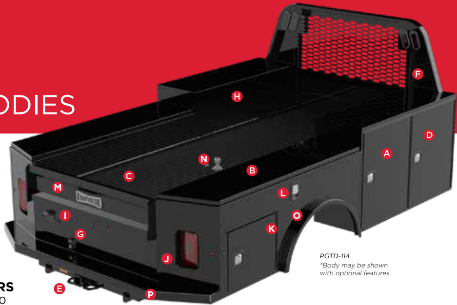
PGTD-114 *Body may be shown with optional features

A. DOUBLE PANELED DOORS consist of 20-gauge, two sided A-40 galvanneal steel