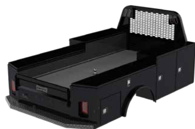
3/16" TREAD PLATE FLOOR