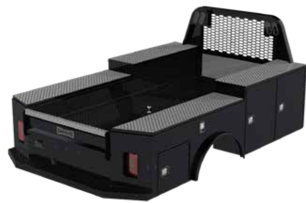
ADDITIONAL ALUMINUM TREAD PLATE OVERLAY