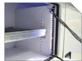
LED COMPARTMENT LIGHTS