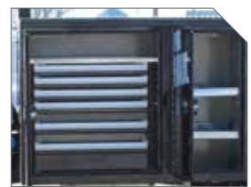
C-TECH DRAWER SETS