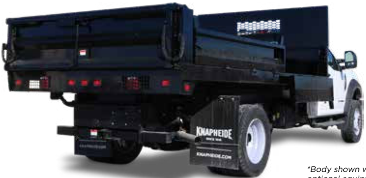
*Body shown with optional equipment.