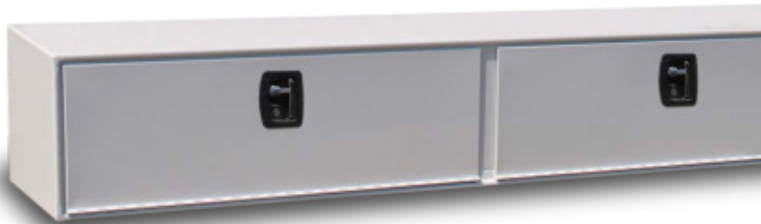
Above body toolboxes