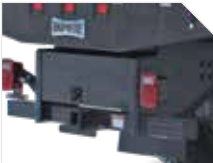
CLASS V RECEIVER HITCH WITH ICC BUMPER