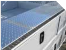
ALUMINUM TREAD PLATE TRIM