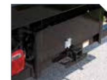
CLASS V RECEIVER HITCH