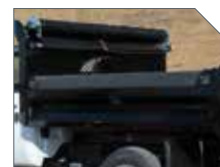
POLY BOARD EXTENSIONS