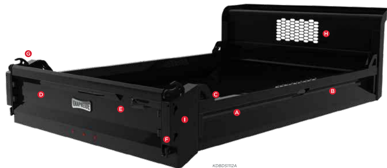
KDBDS1112A *Body may be shown with optional features

constructed of 10-gauge high tensile steel with a punched window for visibility