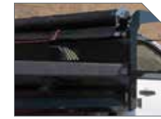
STRAIGHT FULL CAB PROTECTOR