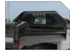
TAPERED QUARTER CAB PROTECTOR