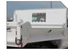
STRAIGHT QUARTER CAB PROTECTOR

‘-P’ denotes prime paint; ‘-B’ denotes black finish paint.