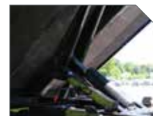
BODY RAISE INDICATOR