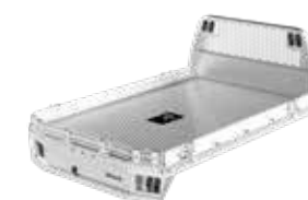
ALUMINUM DROP SIDES