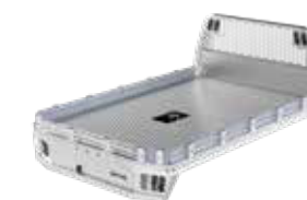
ALUMINUM 6" HIGH SIDES