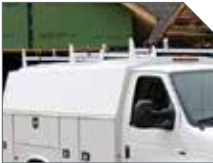
3 BOW LADDER RACK