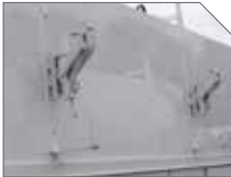
SIDE MOUNT LADDER RACK