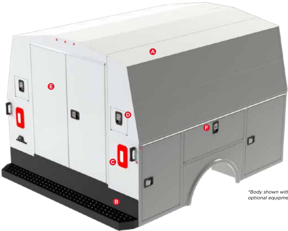
*Body shown with optional equipment.

make opening and closing easy, providing access to spacious side compartments