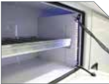
LED COMPARTMENT LIGHTS

installed at the rear of the vehicle provide an extra level of safety to users