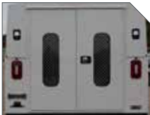
REAR DOOR WINDOWS