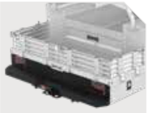
ALUMINUM DROP SIDE RACK SETS (12" AND 18")