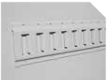
E-TRACK & ACCESSORIES