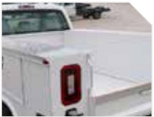
ALUMINUM TREAD PLATE TRIM KITS