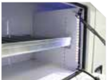
LED COMPARTMENT LIGHTS