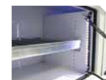
LED COMPARTMENT LIGHTS