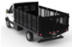
PVMX WITH LANDSCAPE RACKS