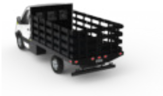
PVMX WITH STAKE RACKS