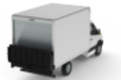
BOX TRUCK BODY WITH LIFTGATE