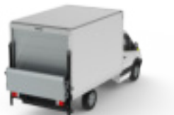
BOX TRUCK BODY WITH RAILGATE