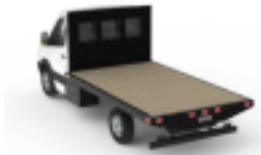
PVMX PLATFORM BODY