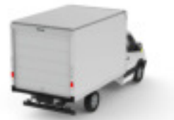
BOX TRUCK BODY