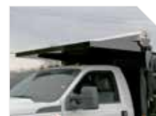
42" CAB PROTECTOR WITH 4 TIE DOWNS