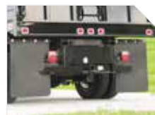
COMBINATION CLASS V HITCH AND ICC BUMPER