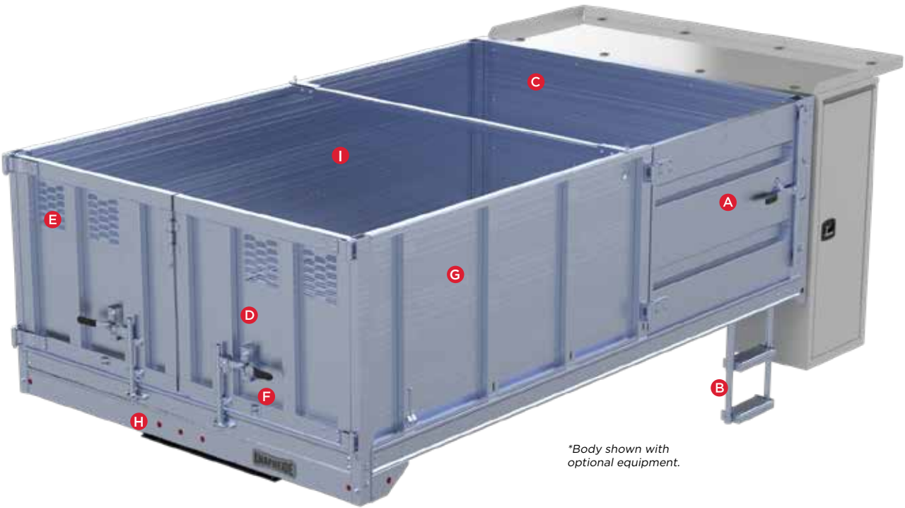
*Body shown with optional equipment.

resulting in a body that is 40% lighter than steel, returning payload back to the operator