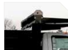
PULL TARP SYSTEM