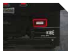
KNAPHEIDE LED TAIL LIGHTS