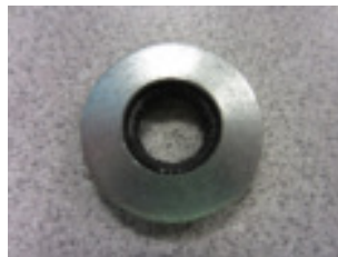
(8) Sealing Washer .33 x .75 Part# 12051132

CAUTION: Use of hardware other than provided, or alternative installation methods other than outlined herein, may void the product warranty. Fasteners should be snug, but not overtightened. Use caution when using air or battery operated tools.