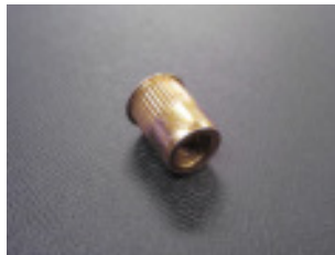
(13) Ribbed Riv-nut M6 Part# 31568900