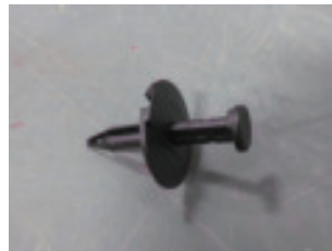
(3) Push Type Retainer Part# 31648940