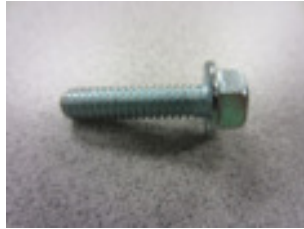
(9) Whiz Bolt M6 x 40 Part# 31568920