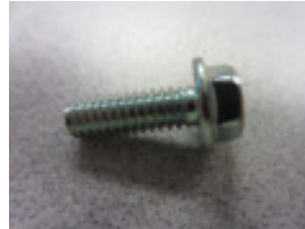
(8) Flange Bolt M6 x 25 Part# 31568910