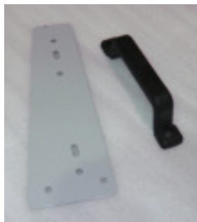
(1 ea.) Grab Handle Part# 26268821 & Grab Handle Bracket Part# 26268243