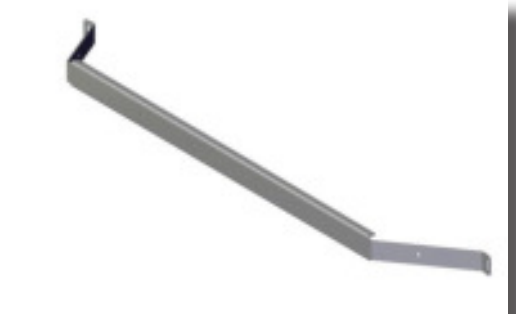
(1) B-Pillar Brace Part# 26265546

CAUTION: Use of hardware other than provided, or alternative installation methods other than outlined herein, may void the product warranty. Fasteners should be snug, but not overtightened. Use caution when using air or battery operated tools.