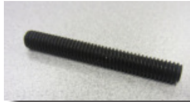
(6) Set Screw 5/16-18 x 2-1/2 Part# 30708230