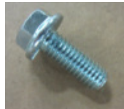
(4) Hex. Head Serrated Flange Bolt 5/16-18 x 1 Part# 31268790