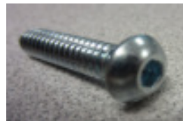
(2) Button Head Screw 1/4-20 x 3/4 Part# 32269600