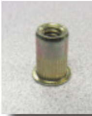
(10) Ribbed Riv-nut 5/16-18 Part# 21900246