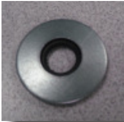
(10) Sealing Washer 7/16 x 1.00 Part# 12051132