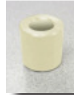
(6) Spacer 1.00 O.D. x 5/16 I.D. x 3/4 Part# 32269170