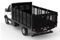
PVMX WITH LANDSCAPE RACKS