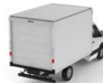
BOX TRUCK BODY