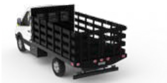
PVMX WITH STAKE RACKS