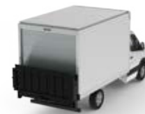
BOX TRUCK BODY WITH LIFTGATE