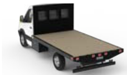
PVMX PLATFORM BODY