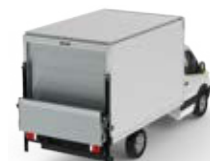
BOX TRUCK BODY WITH RAILGATE